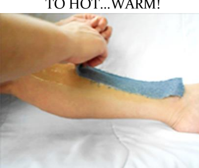
Holding the top of the strip, grasp tightly while flexing or tightening the skin