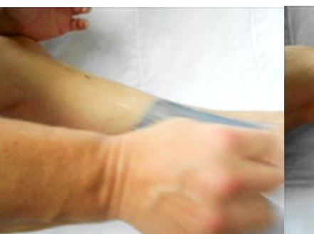
Remember to pull/yank/rip IN THE SAME DIRECTION OF HAIR GROWTH Stay PARALLEL and close to the skin