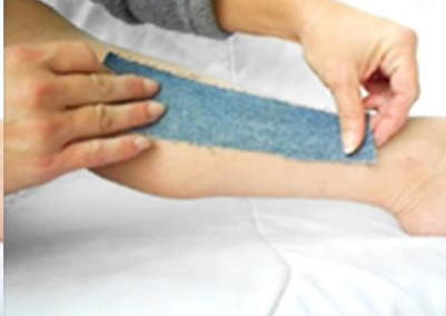
Apply pre-cut denim strip on the ORGANIC SUGARING WAX