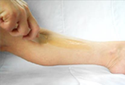
Spread a THIN LAYER EVENLYusing applicator in the **OPPOSITEDIRECTION OF